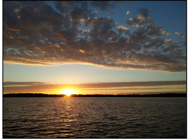
Beautiful sunset on Thursday evening during our conference Lake Minnetonka cruise