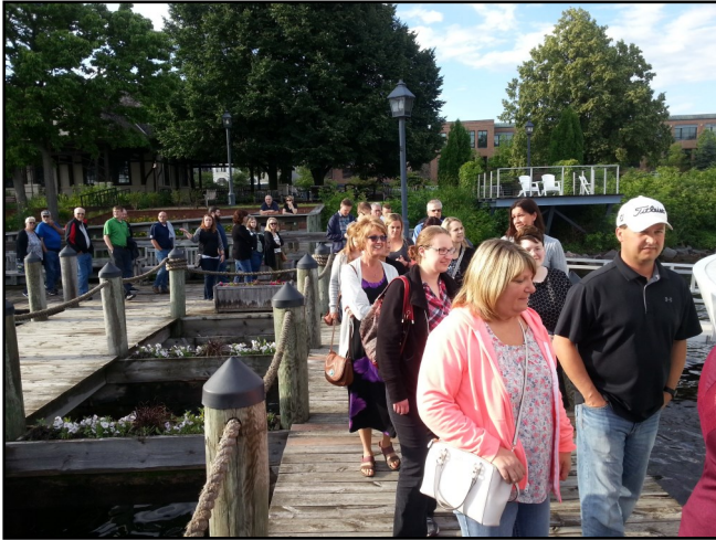
Loading the Lake Minnetonka yachts for the dinner cruise